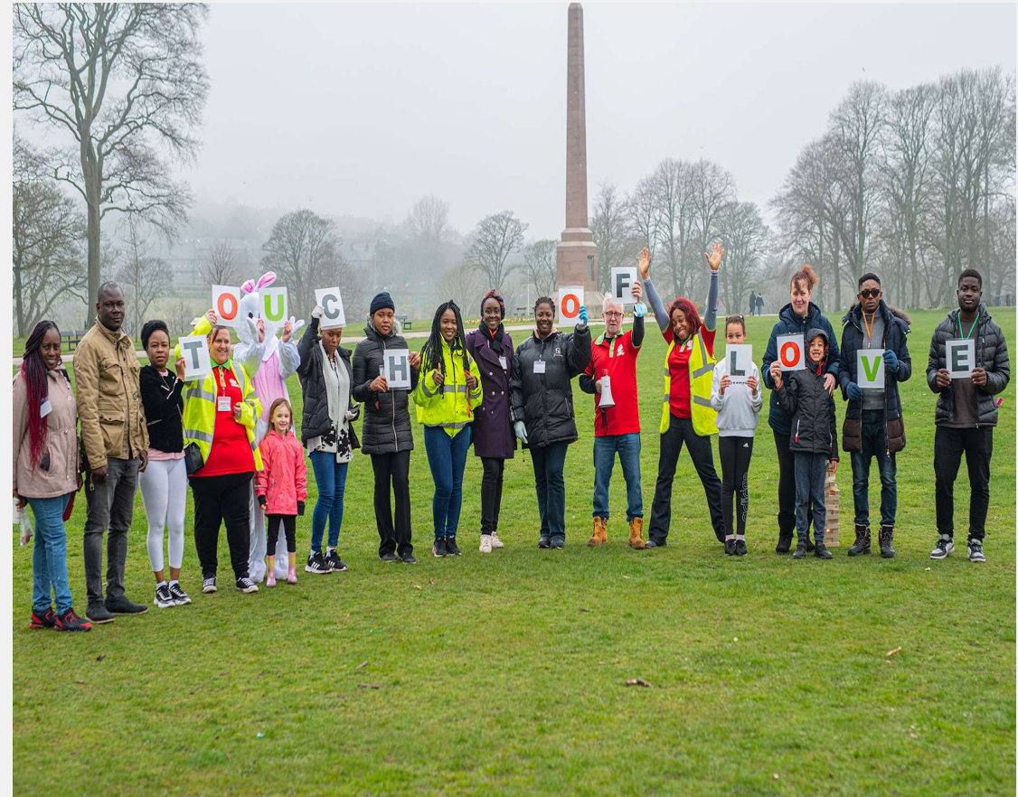
Celebrating Unity and Support